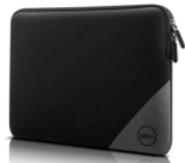
Dell Pro Sleeve 13